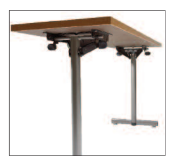
The folding leg mechanism easily releases and folds legs tightly to the table bottom, securely locking legs for storage.