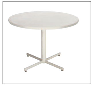
Portico tables are available in fixed, folding and flip-top models. Fixed and folding models can be ganged.

Offering clean and simple design, Portico tables complement any environment and provide exceptional durability.