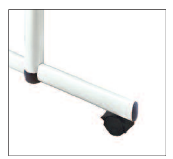
Optional casters allow tables to move effortlessly.