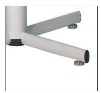
Customize end cap and trim colors to complement KI stack seating.