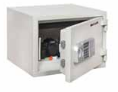
KF2418-HBLE FIREKING 1/2-hour fire rated