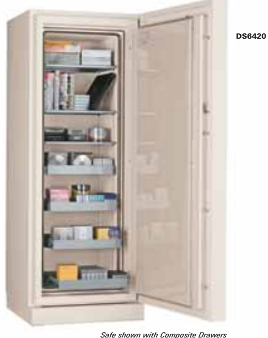
and Fixed Shelves (sold separately).