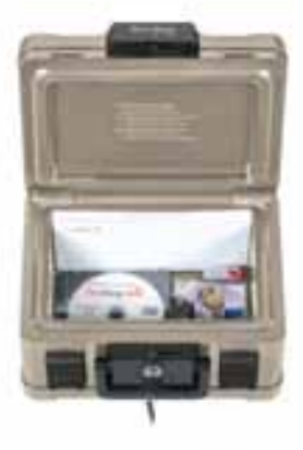
SS 102 Holds # 10 envelopes and folded documents

SS103 Holds letter and A4 size documents flat