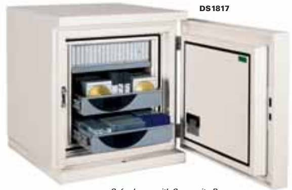
Safe shown with Composite Drawers and Fixed Shelves (sold separately).