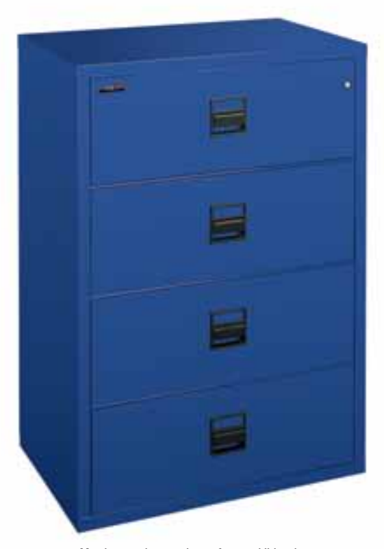
Match any color you choose for an additional cost