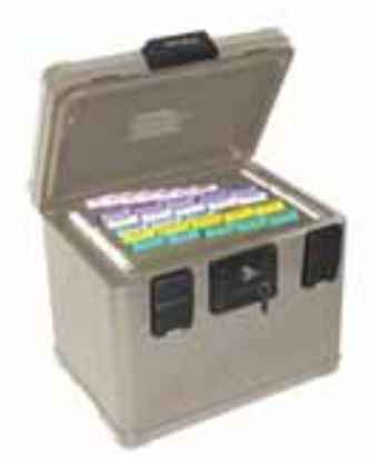
SS106 Holds letter and A4 size hanging file folders