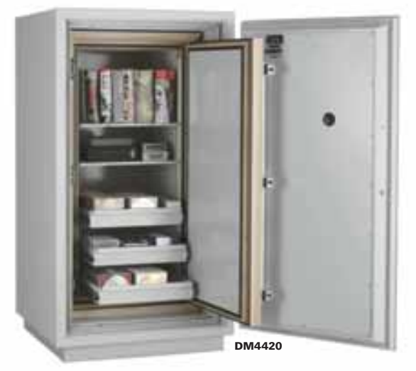
Safe shown with Composite Drawers and Fixed Shelves (sold separately).