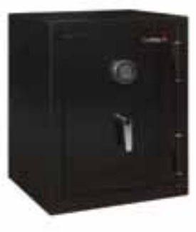
This model comes standard with two shelves.