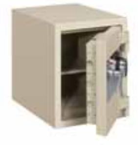
For added security, a <sup>7</sup>/<sub>8</sub>" anchor hole comes standard in the bottom of the safe.