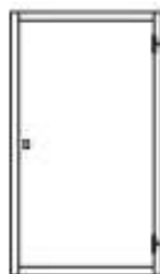
1 Door (31" X 18")