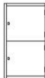
2 Doors (Each 15" X 18")