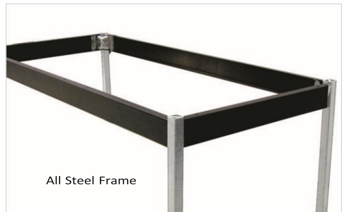
All Steel Frame