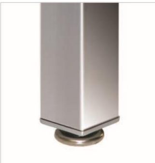
Square Tube Legs with Adjustable Steel Glides