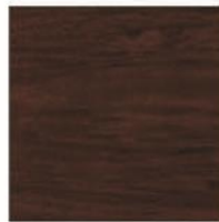
Mahogany 7040-60 MA