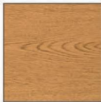
Light Oak 7888-60 OK