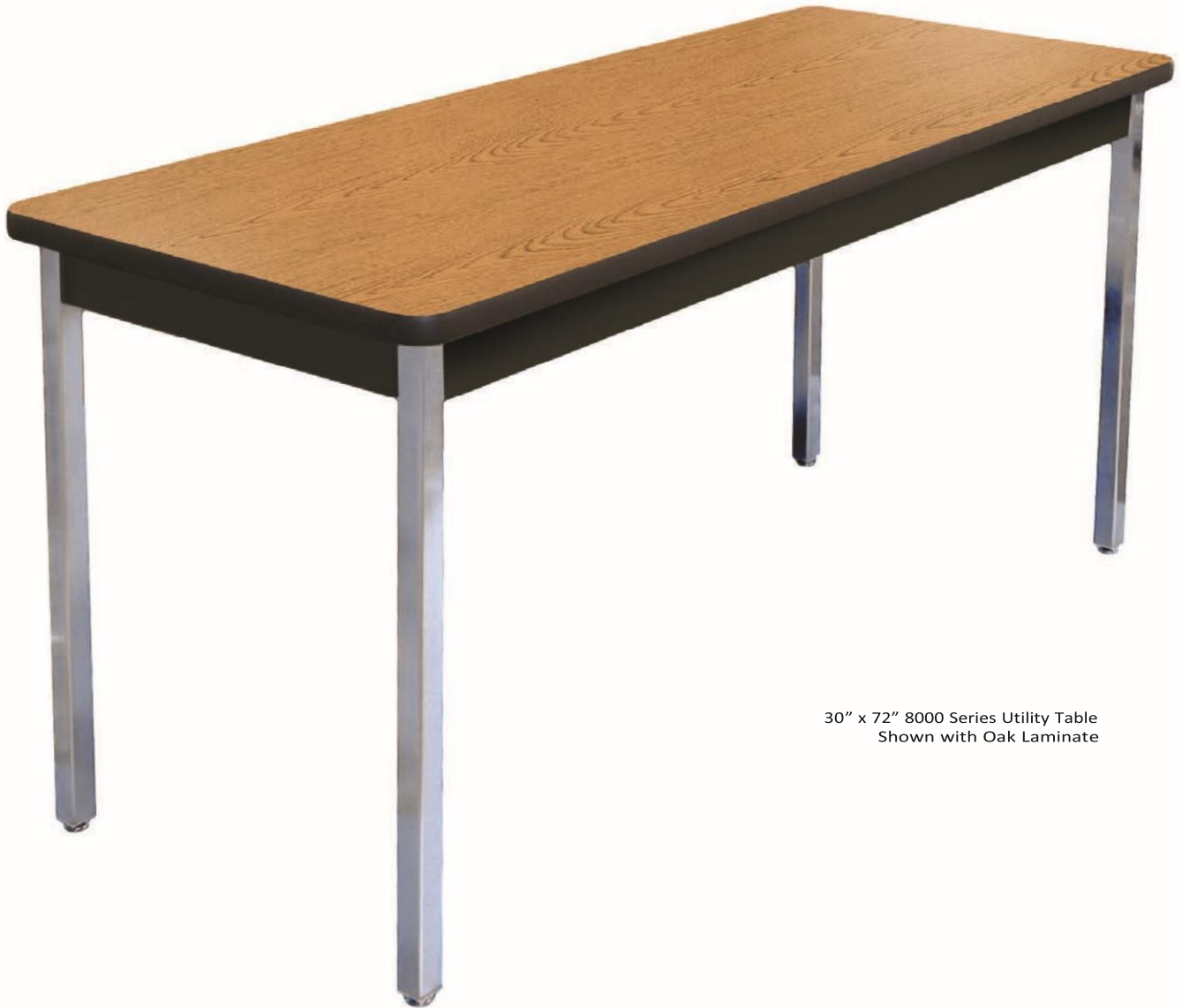
30" x 72" 8000 Series Utility Table Shown with Oak Laminate

The 8000 Series Utility Table is a staple in many settings due to its inherent design characteristics. Steel frames and strong 1¼" thick particleboard with high pressure laminate surface construction ensure that these tables provide many years of dependable service.