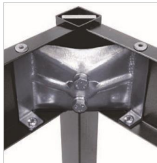
Reinforced Twin-Bolt Corner Brackets