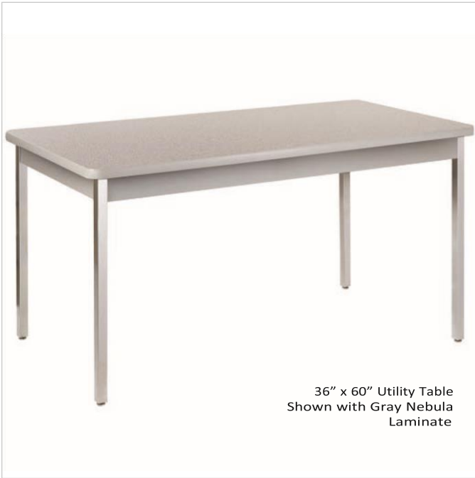
36" x 60" Utility Table Shown with Gray Nebula Laminate