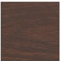
Walnut W313-60 WA