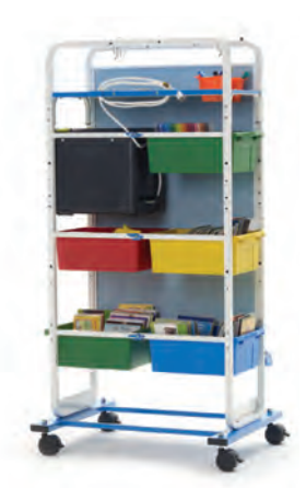
Dual Duty Teaching Easel with Tech Tub® and Open Tubs (FTT202)