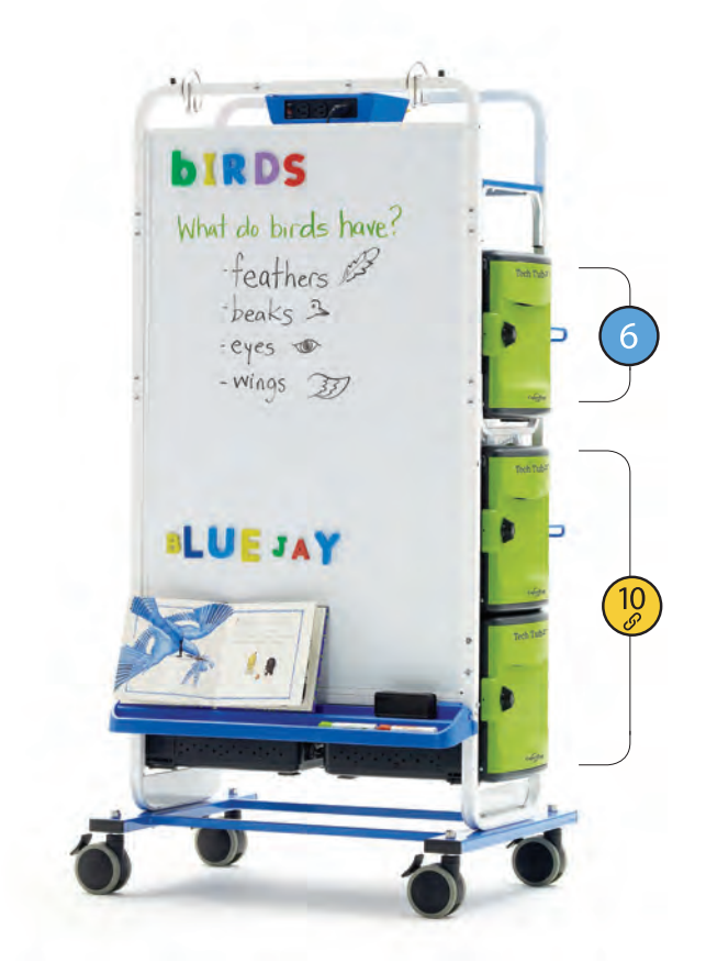
Dual Duty Teaching Easel with 4 Tech Tubs® (FTT200) (2 x FTT600 and 2 x FTT1000) Over-sized whiteboard measures 41 3/4" H x 26 3/4" W

5 year frame Lifetime Tubs Lifetime Tech Tub<sup>2®</sup> 1 year electrical components