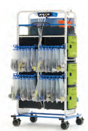
Dual Duty Teaching Easel with 32 hanging headphone pouches (FTT200)