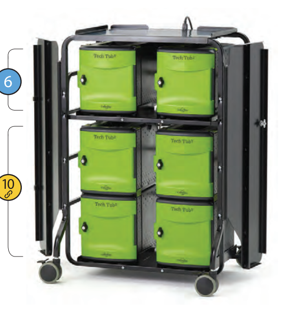
High security model with locking doors (FTT432)