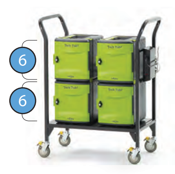
Holds 24 devices and the tubs break apart using clips (FTT624)