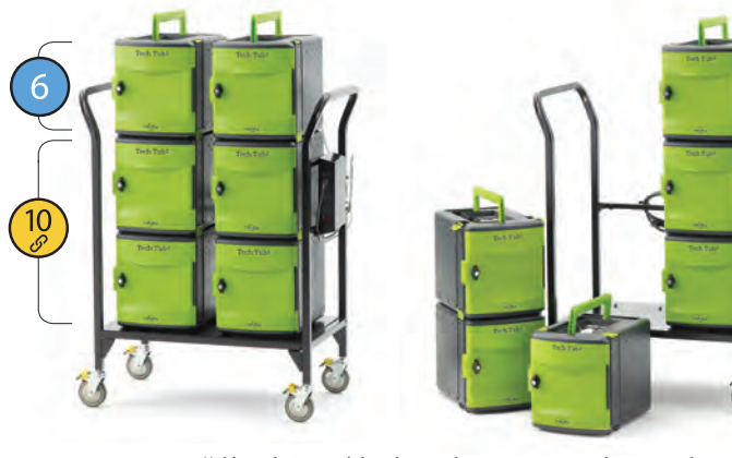
Holds 32 devices and the 2 lower tub sets are permanently connected together, but can be removed from the cart (FTT632)