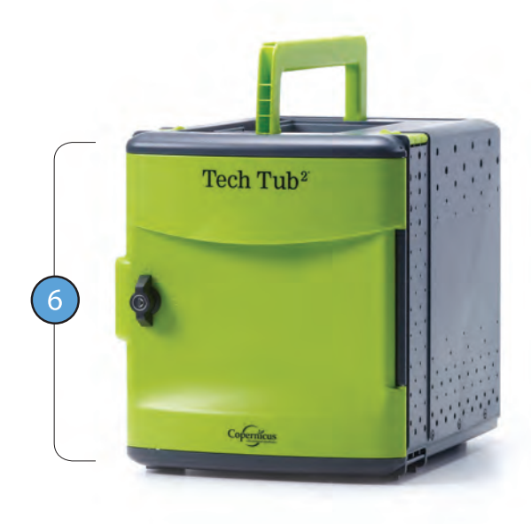
Premium Tech Tub<sup>2®</sup> - holds 6 devices (FTT600)