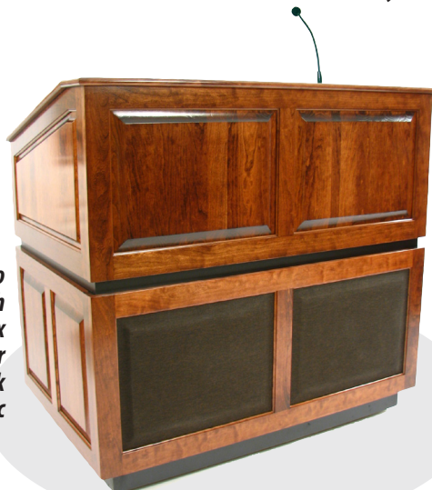
SS3035 Ambassador Lectern with wired Sound

Stand up to 20' away, with Sensitive AmpliVox Electret Condenser Gooseneck Hot Mic