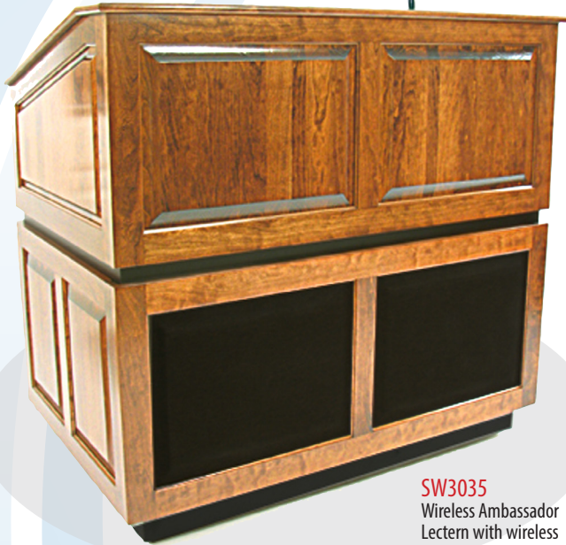
SW3035 Wireless Ambassador Lectern with wireless sound