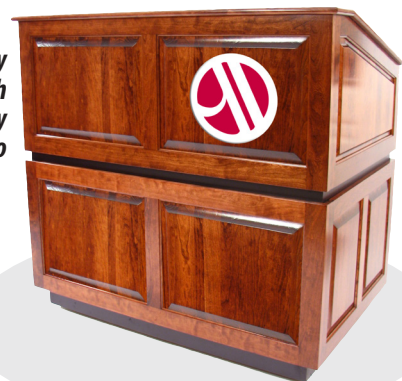
SN3035 Ambassador Lectern without Sound

Customize any Lectern with your Company Logo