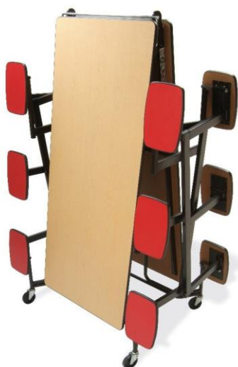
Model # NP12-12 29