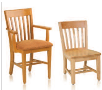
Chairs - wood chairs with upholstered or wood seats, armless chairs available in three heights, chair with arms available in 18" height only.