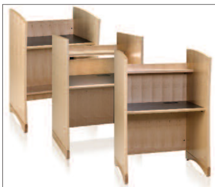
Carrels - stand-up computer station, ADA height, single face and double face units in 36" and 48" widths - PowerUp option or grommets available.