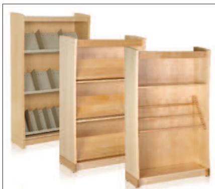
Display Shelving - media display steel shelving, periodical shelving and newspaper display units in various heights, single face and double face units.