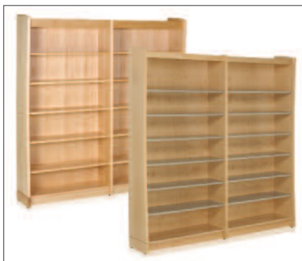
Shelving - wood or steel shelves in several heights, single face and double face units.