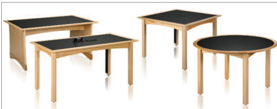
Study Tables - panel leg, rectangular, square, and round shapes in various sizes. PowerUp option or grommets available.