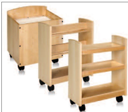
Accessory Units - descending platform book truck, rolling book cart with flat or slanted shelves.