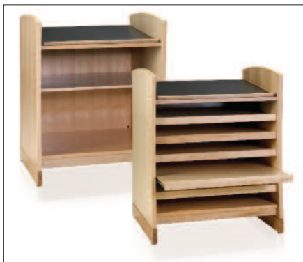
Accessory Units - dictionary and atlas stands, 29" x 36" x 45".