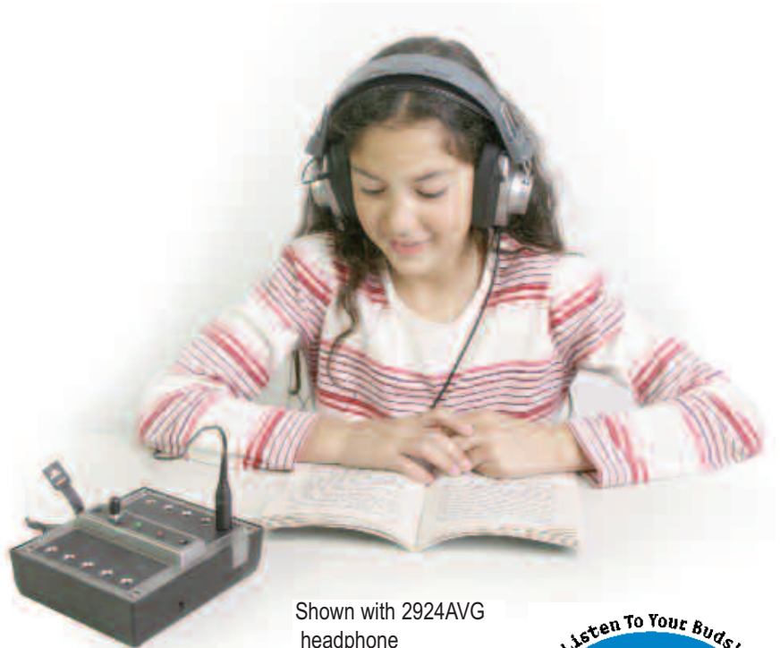
Shown with 2924AVG headphone

The Sound Alert jackbox can be purchased as part of the 8-position Sound Alert™ Listening Center ( 1285G-08 ), which also includes eight matching 2924AVG monaural headphones and rugged carry case. With the sound level controlled from its jackbox, this listening center safely modulates the volume to any attached headphone (not needing to be the 2985PG ) and can be adjusted to a safe 85 decibel level.