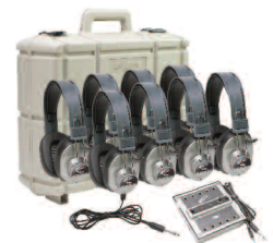
8-position Sound Alert™ Monaural Listening Center

Califone® International Inc. 800-722-0500 califone.com