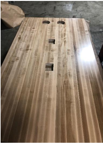
(1) ONE BUTCHER BLOCK TOP