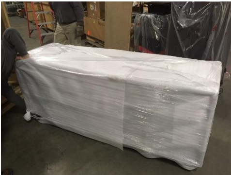
(1) ONE ED TABLE ASSEMBLY PORTION