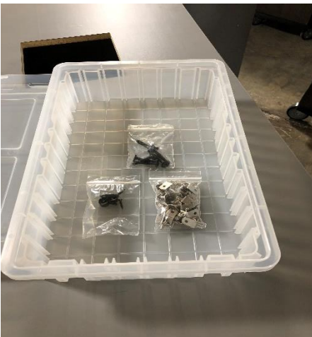
(8) EIGHT ¼" 20X35MM BOLTS