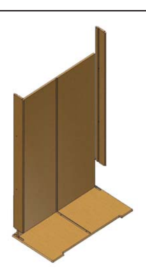
Step 1: Attach Top to Side, aligning groove in underside of Top with dado in Side. Attach components together with (2) Hex screws and Allen wrench.