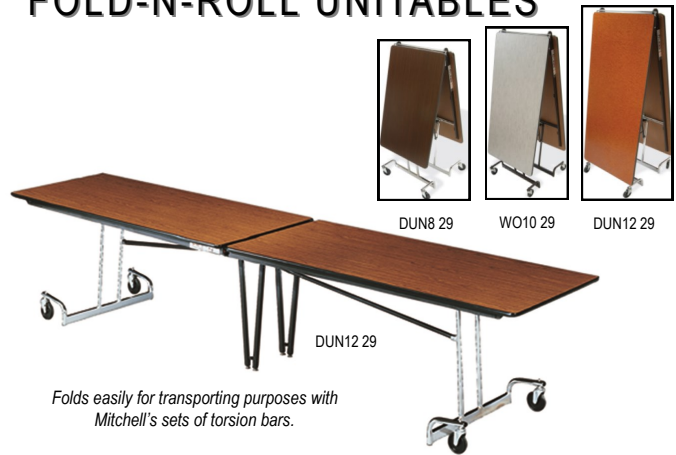
Folds easily for transporting purposes with Mitchell's sets of torsion bars.

Available in 8'-1", 10'-1" & 12'-1" L x 30" W and either 27" or 29" H. Mitchell offers a choice of Nickel Chromium or Black Powder Coated end legs. UniTables have automatic steel locks when the table is in the user position and steel uplocks when transporting.